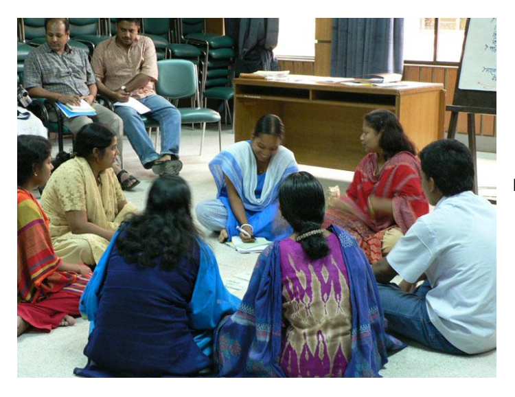
Preparing for field work

A corresponding list was used to organize the feedback of field work findings, in short: