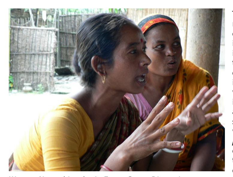
Woman Natural Leader in Focus Group Discussion

Before the discussion, it should be pointed out that men in the groups of poor households have been empowered in relation to better off men and political structures. Many dimensions of empowerment referred to in the table would apply to men, with the notable exceptions of mobility, household decision making and bodily integrity. Men also use a range of collective strategies to be effective. A simple example: they found that if they asked to see the chairman as a group of 4 or 5 men, they were more likely to succeed.