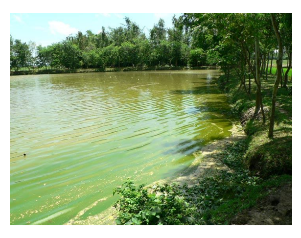
Khas pond in Mankira

In Jalagari, a rotating fund of Tk50,000 was provided because there had been a flash flood (October 2004) which destroyed crops in nearby fields and many households (28 of the 95 households in the para ) were suffering hunger, with five households literally starving. This fund served to provide interest-free loans for small businesses, many of which were critical in raising very poor households out of poverty, in a way that would simply not have been possible using loans from NGOs providing credit or from money lenders. These 28 households which benefited from the loans then formed a savings group (with a majority of women members) to manage their businesses and repay their loans.