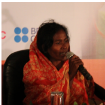
Left: SETU beneficiary speaks to an audience of donors and government representatives about her experiences in the project