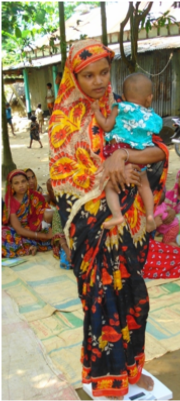
Above: SHOUHARDO beneficiary and her child being assessed by the team