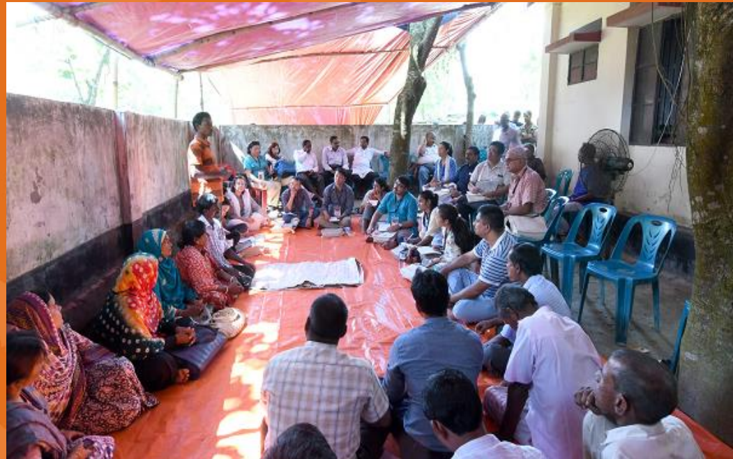
Social audit in community clinic