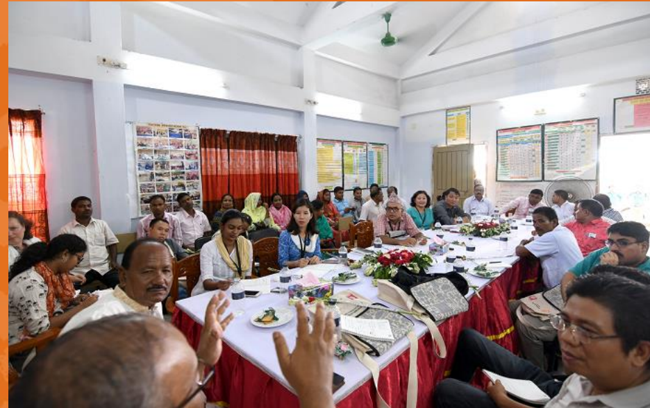
Presentation on social accountability approaches

These models and tools can be replicated in any relevant contexts within the region and around the world!