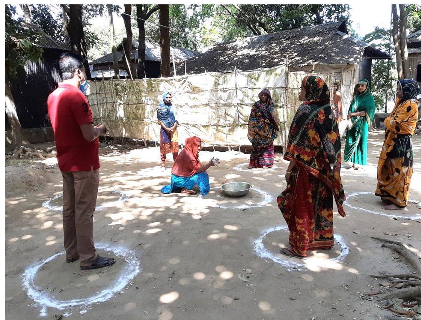
Hand washing demonstration to prevent COVID-19 at community level.

Mass awareness on prevention, social distancing and identification of symptoms