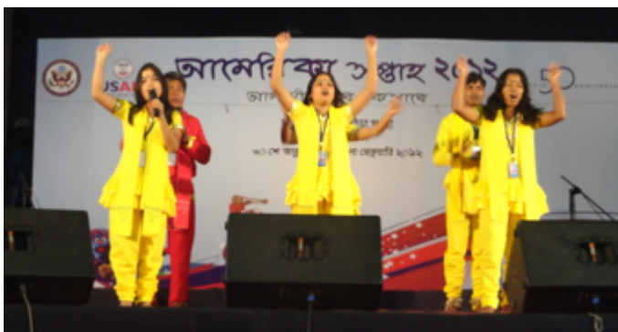
ABOVE: Theatre performance by MISHUK theatre group for SHOUHARDO II