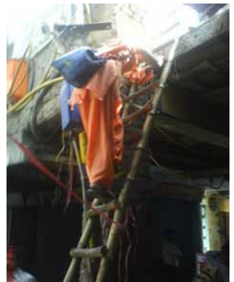
A Nepali woman climbing down from her residence in Delhi

“In all these years you people are the only one who came to enquire about our well-being. The rest all come either to frighten or to harass us.”