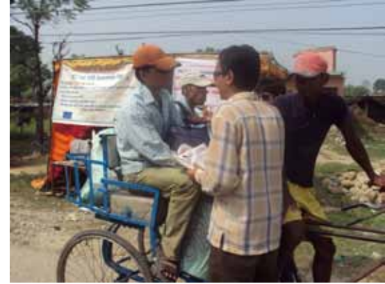
Samajik Samanata Aviayan (SSA) Sub grantee (Nepal) staff giving HIV related information to returnee from India

The Mass Awareness Program was successful in reaching approximately 7,000 people with HIV awareness message.