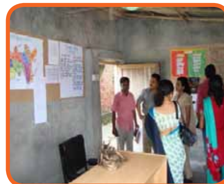
EMPHASIS India team and Regional Secretariat staff visit Chanduria Community resource center.