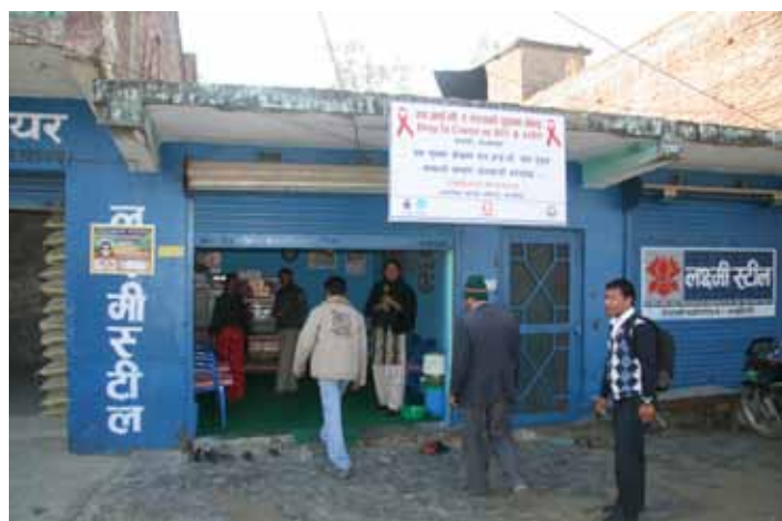
A Drop-in-Center for mobile population in transit to and returning from India.

Staffed mainly by local facilitators and volunteers together with two to three Outreach Workers, the centers are meeting places where mobile populations can visit and get information on topics related to HIV prevention, proper user of condom, and counseling services when travelling to their destination or coming back home. The centers also mobilize a number of Peer Educators who visit the mobile population and provide health education, referral/linkages services.