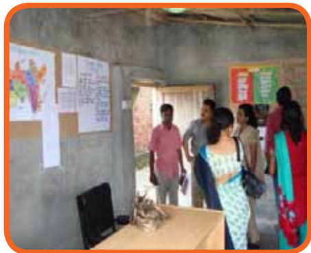
Community Resource Center, Chanduria, Bangladesh