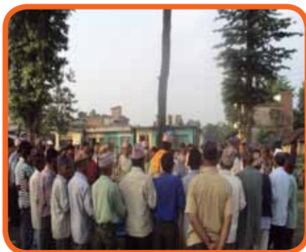
Mass Awareness Program in Dhangadi, Nepal