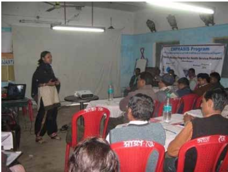
A woman living with HIV shares her experiences with service providers

The EMPHASIS team in India organized a capacity building program for 18 local health service providers in West Bengal on 24th December 2010. The program dealt with topics on epidemiological issues of HIV and AIDS along with STI management, Syndromic approach, ethics, confidentiality, counseling techniques,