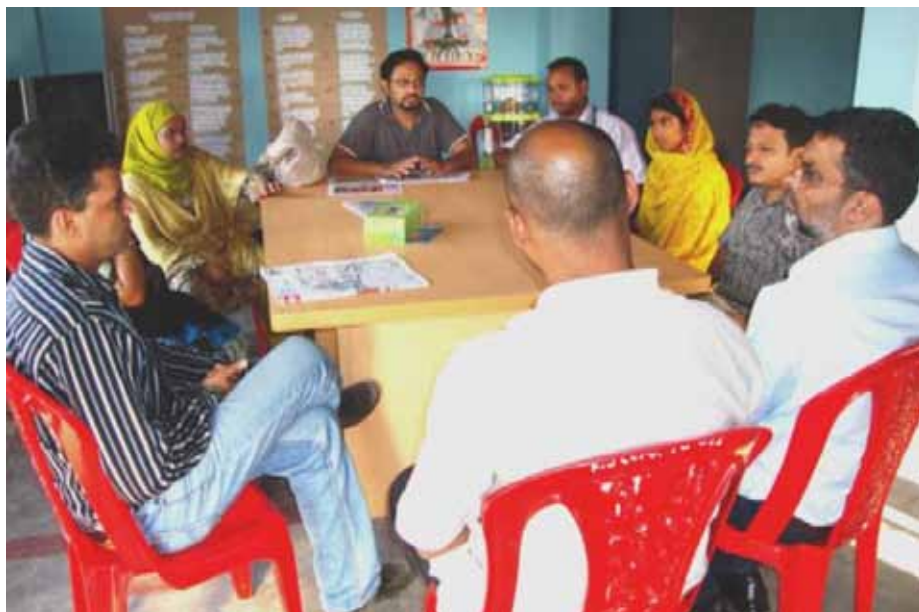
EMPHASIS India Team is discussing with staff of Bhomra DIC

The meeting resulted in documenting the following: