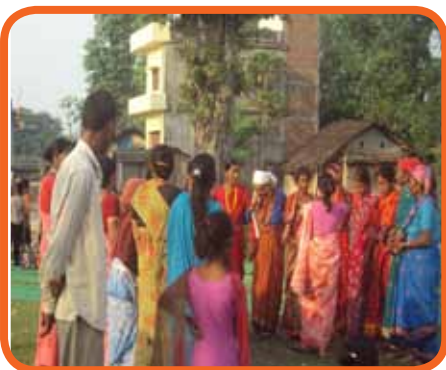
Mass Awareness Program in Dhangadi, Nepal

In addition to Delhi and Kolkata, Mumbai has been added to EMPHASIS project sites. In the project's first year we saw a significant number of Nepali and Bangladeshi mobile population go to Mumbai for work. An initial mapping of the mobile population has been completed and the selection of a local sub grantee is underway to begin implementation of services to the mobile populations from Nepal and Bangladesh.