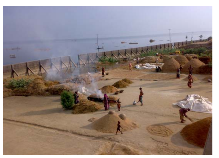
People are busy for harvesting

Early flash flood & harvesting- In Bangladesh monsoon started from April, especially in haor region. Our data