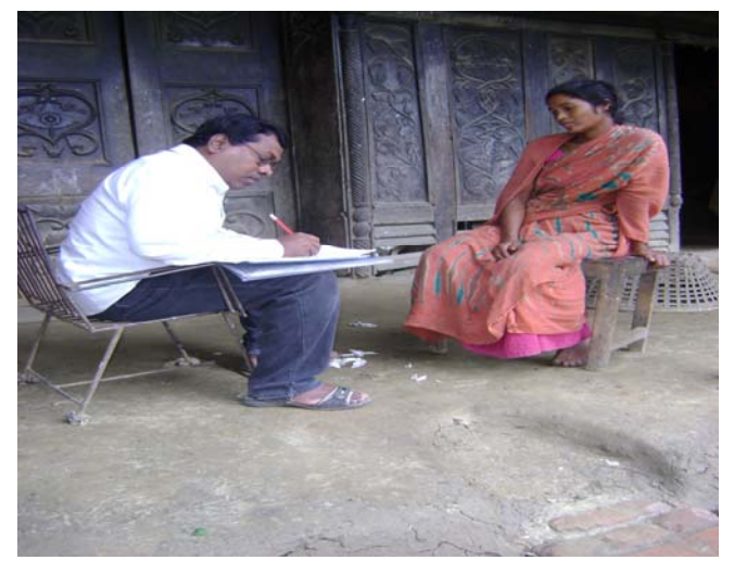
Parent's interview at their home

To ensure the quality of information it was instructed to check the entire form or questionnaire by the respective interviewer and submitted to the 'Supervisor'. Afterward, those were rechecked by 'Supervisor' at