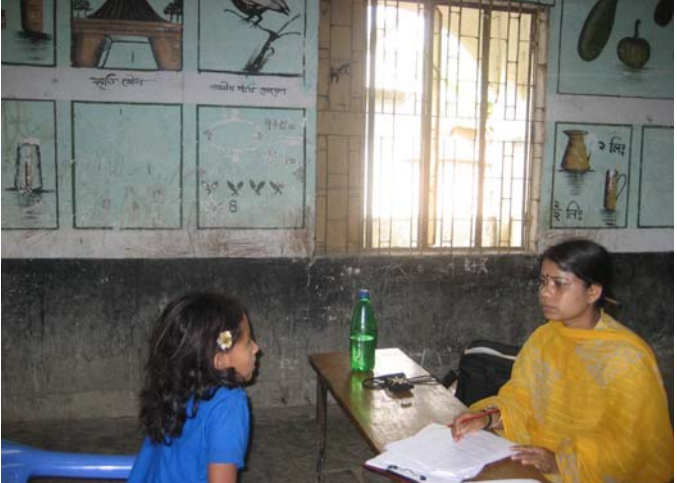
Student's interview at school

Classroom observation- all observation were performed by a pair of data collectors. They got introduced with the respective teachers before