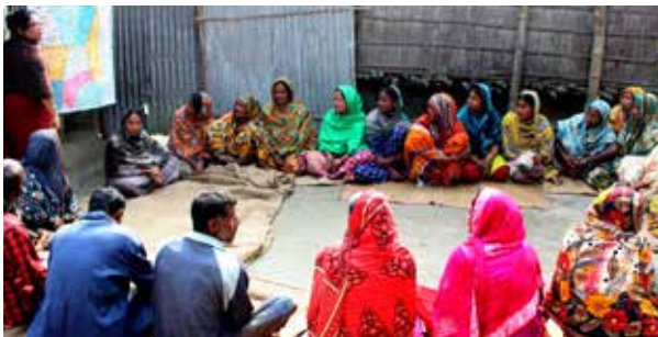
Community discussion on priority issues in Kashirambelpukur UP

Before the participatory UP evaluation meeting, the union's Citizen Forum consults with every ward, to gain citizen perspectives related to UP member contributions to local poverty alleviation processes. The perspectives of communities are disclosed in a very simple manner, in the public meeting. Citizen Forum