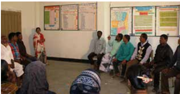
Evaluation session of performance review in Kashirambelpukur UP

In the second year of JATRA, CARE introduced an adaptation to the participatory UP evaluation process. Given that UP members have a significant responsibility to manage block grants from the Local Government Support Program (LGSP II), evaluation criteria from LGSP II was included in the participatory UP evaluation. These evaluation criteria are: planning and budgeting; fiduciary aspects (expenditure, financial management, procurement and reporting); own source revenue mobilization; transparency and accountability; and democratic governance.