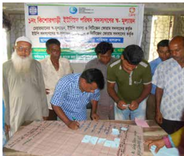
Citizen forum members marking score to UP members in evaluation session in Kishoregari UP

The participatory UP evaluation is conducted every six months during the monthly coordination meeting of UPs. Firstly, each elected representative gives themselves a mark out of 10 for a series of indicators, after reflecting on his or her own performance over the last six months. In each union, the evaluation indicators were determined in a participatory process with consultation with the union's Citizen Forum and UP representatives. The indicators focus on the attitude and behavior of UP members, especially with poor citizens; their timely attendance of public events; UP members being responsive to public queries; fulfilment of commitments given to citizens; and progress on issues identified in their union's participatory poverty analysis (also facilitated by JATRA).