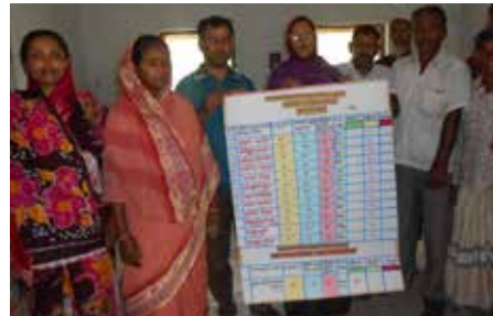
The outcome of performance review in Nitai UP

representatives give a 'green card' to the members whose performance is very satisfactory. The 'yellow card' is given to the members whose performance is moderately satisfactory, but there is scope for further improvement. The 'red card' is given to the members whose performance is not satisfactory. Because the UP members know that they will see the public perspective after they have self-scored, they remain cautious about exaggeration during their self-assessment. The differences between the scoring of UP members and the scoring of civil society representatives are discussed in an open forum, and UP members commit to remedial actions.